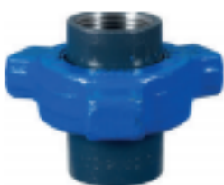
Fig 200 / 206